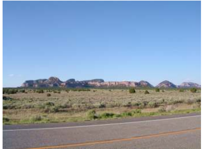
The Sawtooth Mountains viewed from U.S. Highway 60 on the way towards Datil, NM.

The Sawtooth Mountains have always been popular hunting grounds for the Lost Adams Diggings. Indeed, they have a mysterious, ominous appearance with narrow canyons and “haystack” type mountains. However, it is a small mountain range, not fitting the distance descriptions, and nothing close to the zig-zag canyon or gold mineralization has ever been found. The Sawtooth mountains are photogenic and distinctive, and would certainly have been recognized by Adams on his return trips.