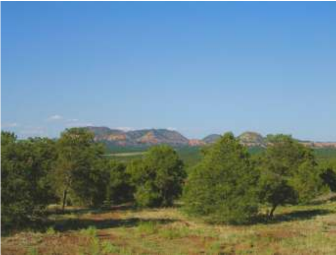
The Sawtooth Mountains viewed from the Continental Divide near Pie Town, NM.