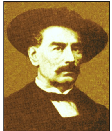
John Cremony was a newspaper man, Spanish and Apache interpreter, and soldier in New Mexico during the 1850–1860s.

This was an interesting time in American history. With the opening of the Santa Fe Trail in 1821, Americans got their first peek into the unknown Spanish world of the Southwest. Newspaper and magazine articles were the first to describe the roaming herds of buffalo, the magnificent Indian Pueblos, and the charming Mexican villages along the Rio Grande to the Americans “back East.” Upon the conclusion of the Mexican-American War, the doors were opened to visit the Territory of New Mexico. For years, newspapers were filled with stories and images of the New Mexico wonders.