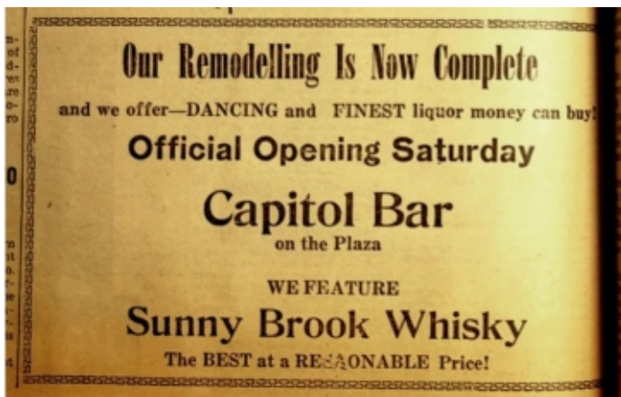
An ad in the Socorro Chieftain announcing the opening of the first Capitol Bar on December 1, 1939. Remodeled from the old Plaza Café, this bar was located in a building north of the present day location.

the liquor license and when they moved to the Plaza Café building, the license went with him. The fate of the Green Front during this period is unknown and it's quite possible the establishment remained open as a pool hall.