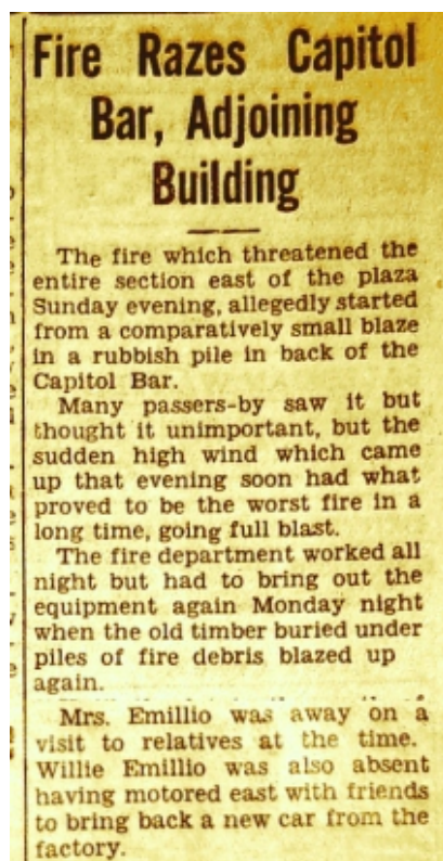
The June 20, 1940 Socorro Chieftain reported the loss of the Capitol Bar to fire.