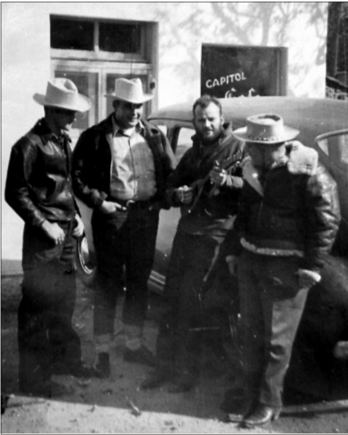
The one-time stucco finish is shown in this 1946 photo of the Capitol Bar and Café during the 49ers celebration.