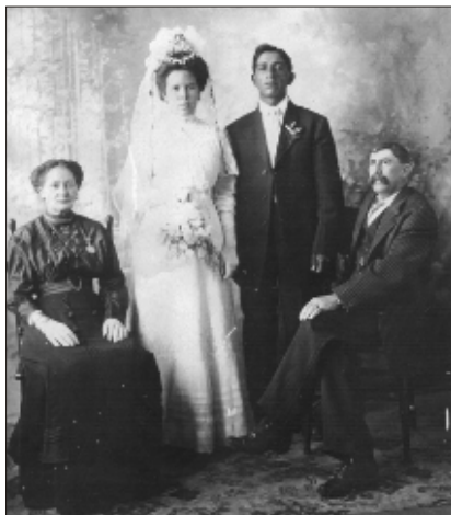
A wedding ceremony conducted by Judge Amos Green, sitting on the right. The Judge, in whole or in part, owned the bars and pool halls of today's Capitol Bar from 1909 until his death in 1925.