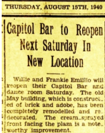
Socorro Chieftain articles of rebuilding the Capitol Bar.